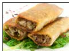
Duck Spring Roll