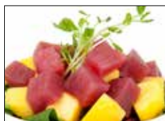
Tuna mango Salad