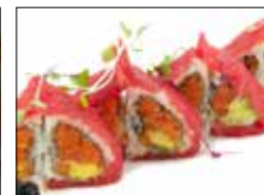
Sweet Heart Roll