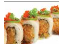
Snow White Roll