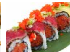
Crazy Tuna Roll