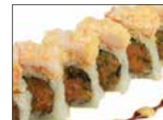
American Dream Roll